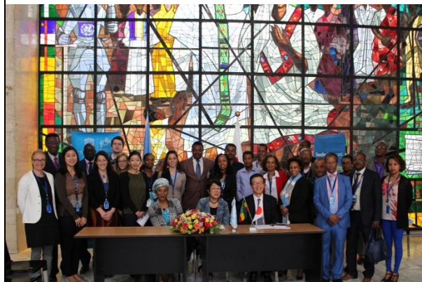
Group Photo with the UNESCO-IICBA team