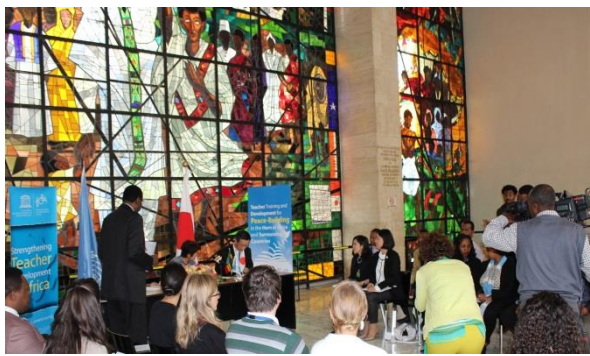
Signing ceremony at Africa Hall, UNECA