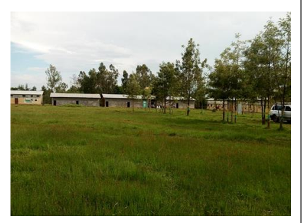
Dongora Elmete Primary School