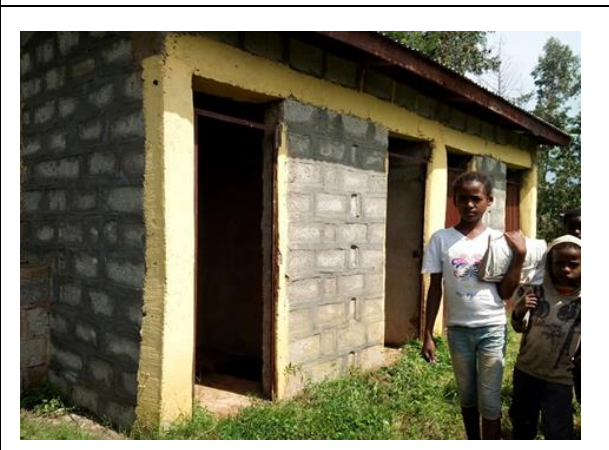
Current toilet block