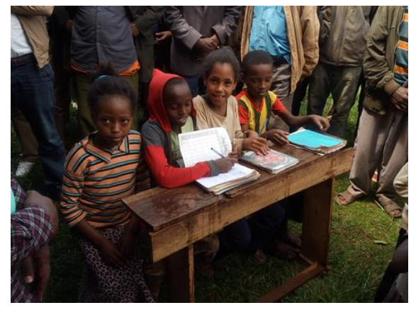
Students studying outside due to the lack of classrooms