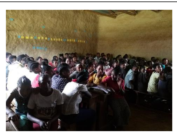
Current Classroom with more than 80 students