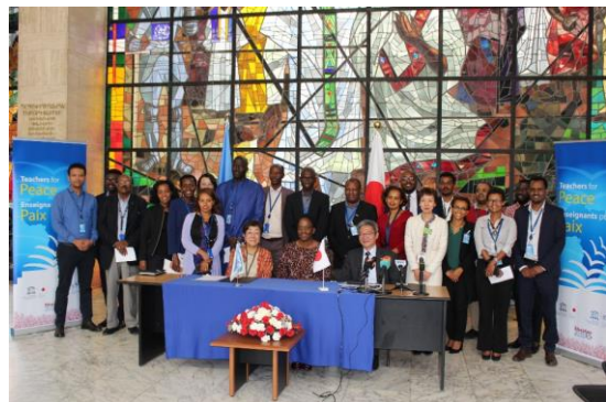
Group Photo with the UNESCO-IICBA team