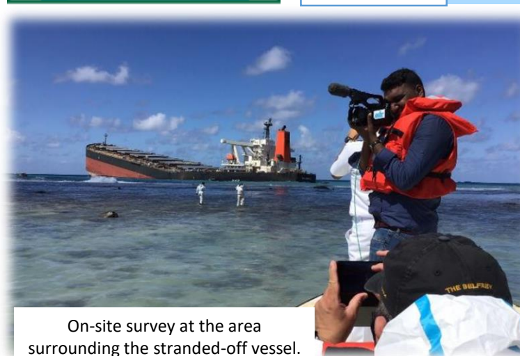
On-site survey at the area surrounding the stranded-off vessel.