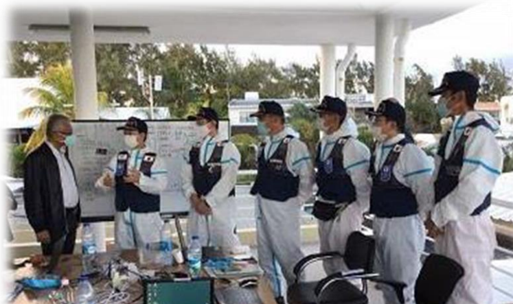
Visit by Prime Minister of Mauritius to the JDR Expert Team

(3) The Government of Japan is planning to dispatch a second JDR Expert Team with seven members on 19 August to enhance its environment assistance. The Expert Team will conduct assistance activities such as countering oil which was washed ashore and understanding its impact on ecosystem of the affected area. Furthermore, the Government of Japan will deliver equipment for oil control and removal, which was requested by the Government of Mauritius, as soon as possible.