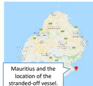
Mauritius and the location of the stranded-off vessel.