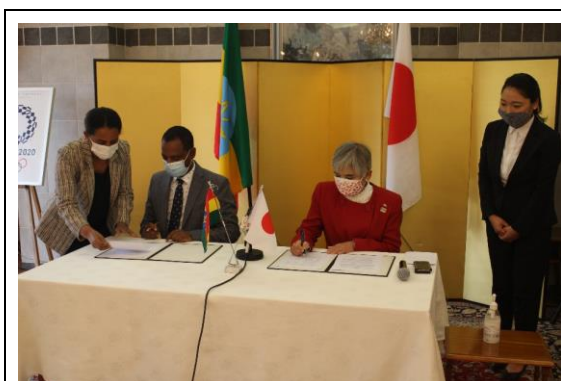
Signing of grant contract