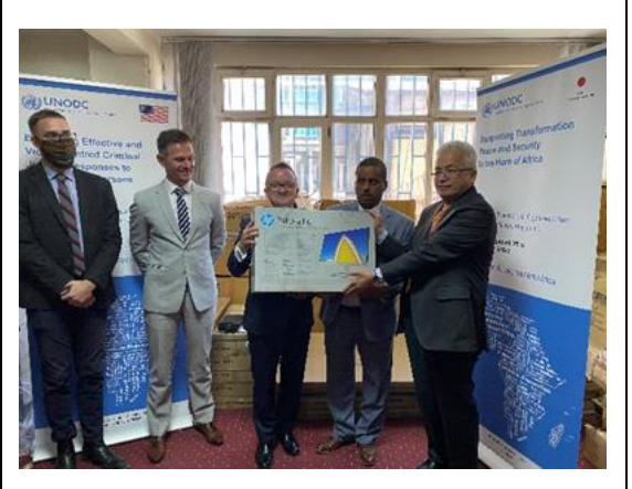
Handover of Equipment