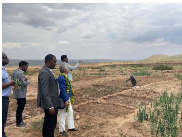
New farms next to the pond