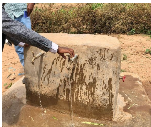
Water supply from the pond