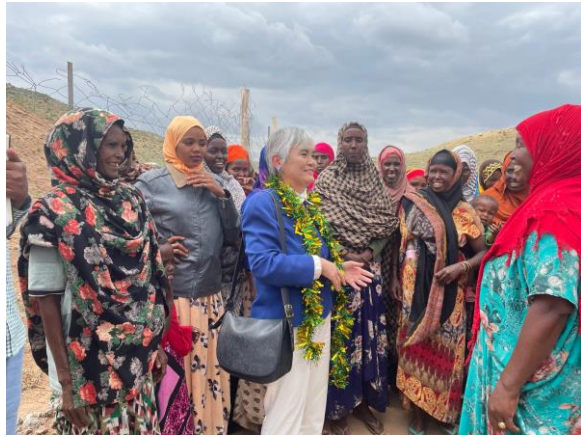
With community members