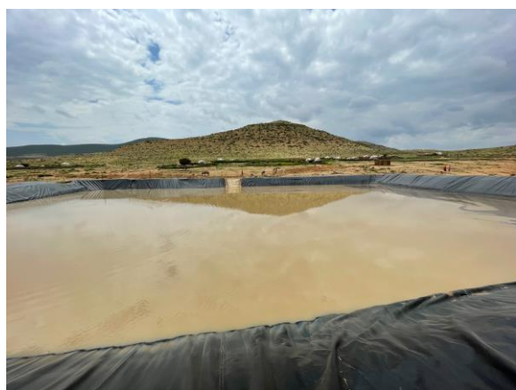
New water detention pond

Participants to the event paid a site visit to one of the detention ponds sites, and observed how the water is now being utilized for feeding livestock and for farming, as well as for family usage except drinking. Maize, onions, tomatoes, peppers, etc. grow in the new farms around the pond for community consumption and cash income.