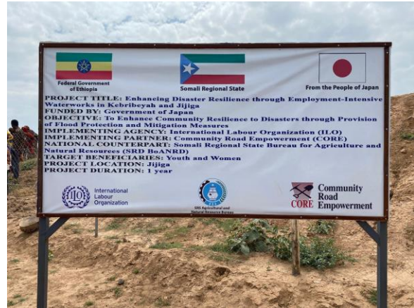
Project sign board