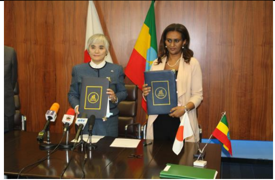
Exchange of Notes