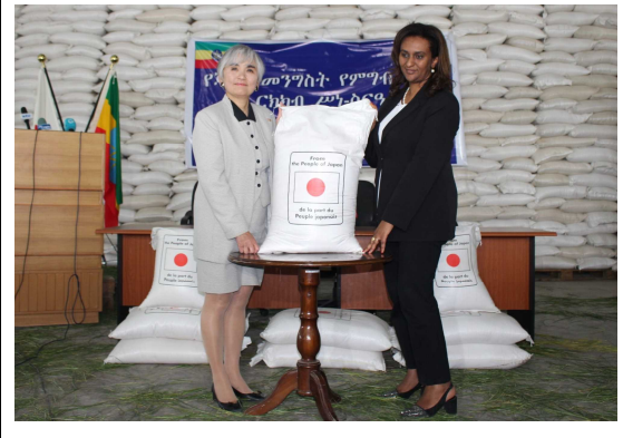
Handover of Rice