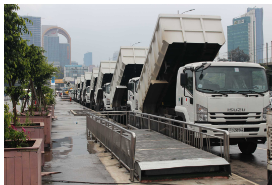
Road Maintenance Equipment