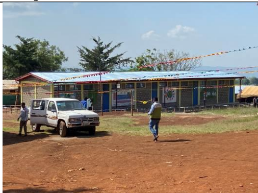
A new classroom block (forward)