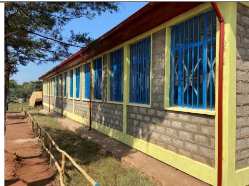
A new classroom block (back)