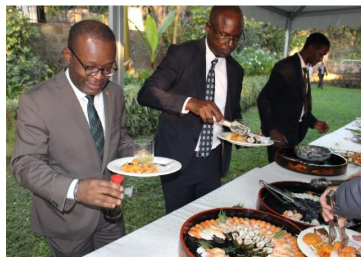
Guests enjoying sushi