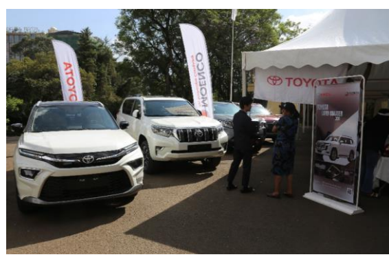
Exhibition of Japanese brand vehicles