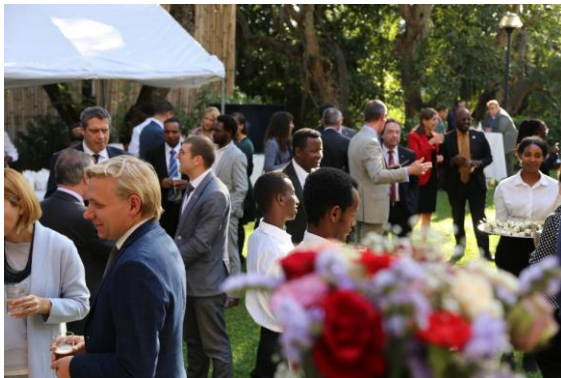
At the Venue