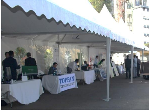
Japanese Company and NGO Exhibition Booths