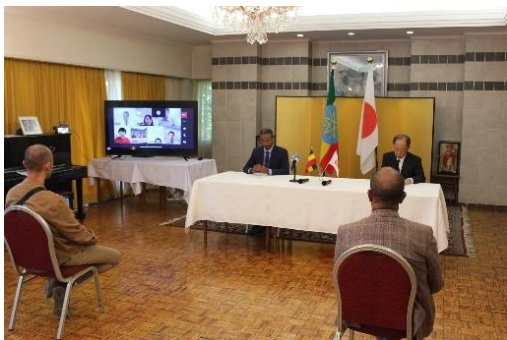
Launching ceremony with online participants