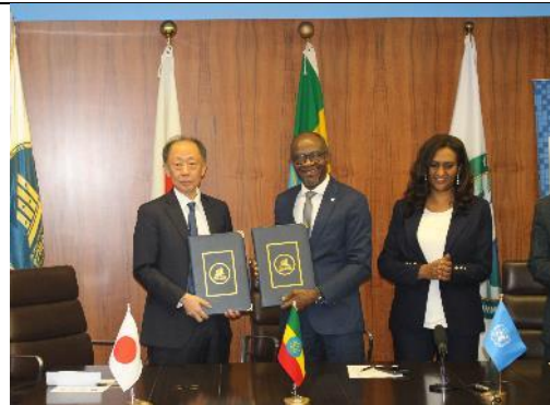
E/N signed between Japan and UNDP Ethiopia Office