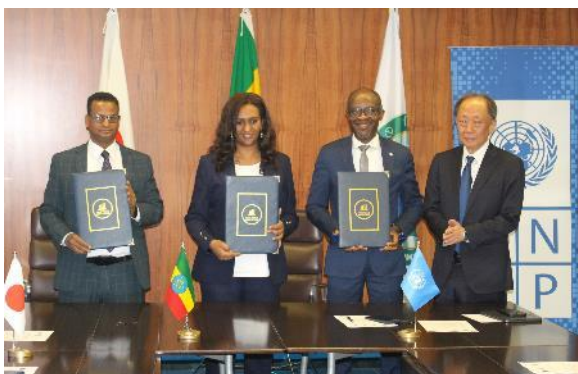
Agreement signed among MoF, NRC and UNDP Ethiopia