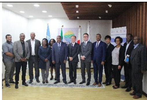
Group photo of people involved in this project.