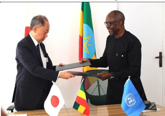
Exchanging the signed notes